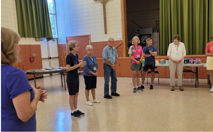
Preparing and Praying