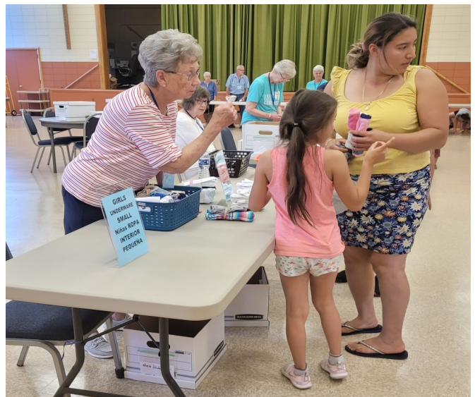
Team members and neighbors