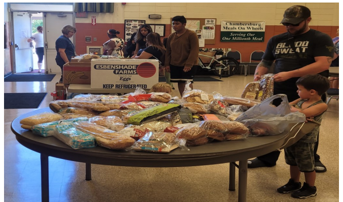
Snacks/food giveaways from Meals on Wheels