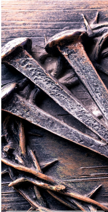
Good Friday April 7th 10:45 AM & 7:00 PM