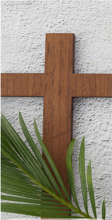
Palm Sunday April 2nd 10:45 AM