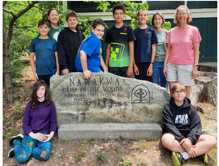
First Lutheran, Trinity Lutheran, St. Paul Lutheran