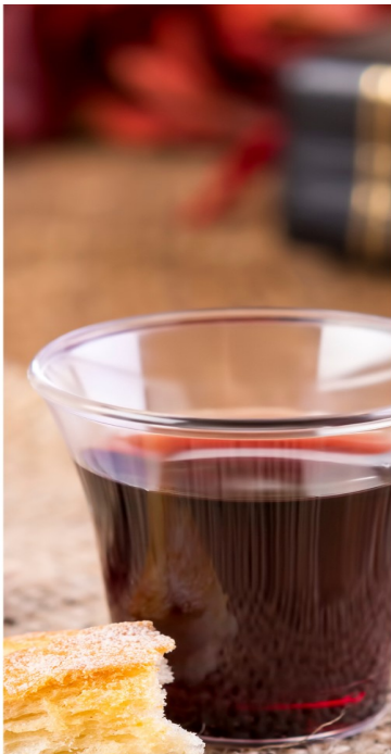
Maundy Thursday March 28 7 p.m.