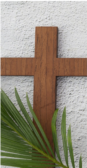
Palm Sunday March 24 10:45 a.m.