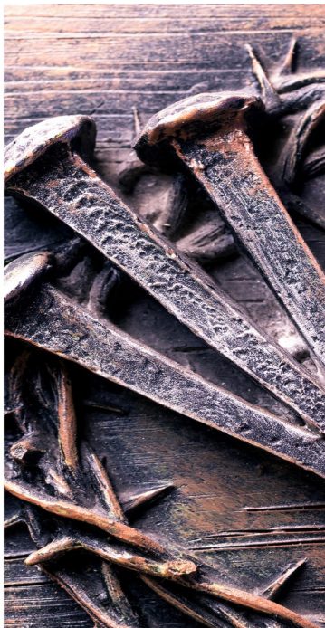
Good Friday March 29 10:45 a.m. 7:00 p.m.