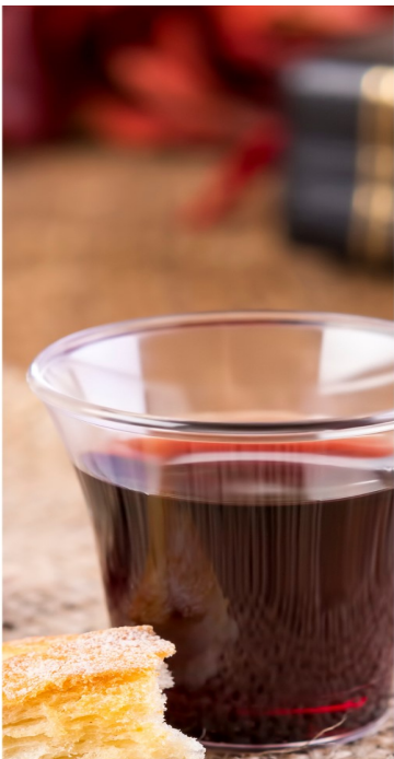
Maundy Thursday March 28 7 p.m.