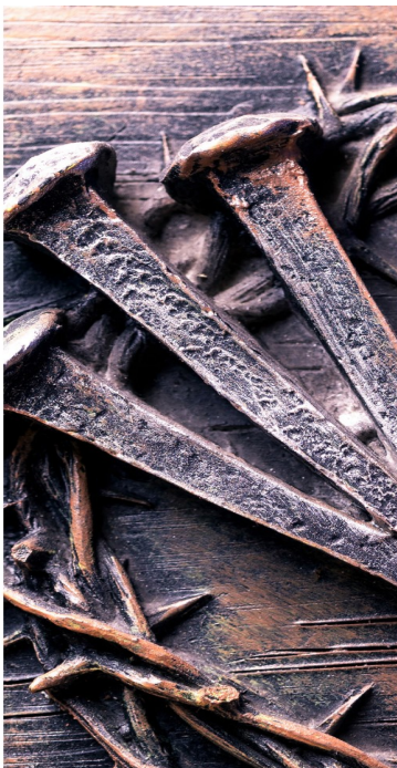
Good Friday March 29 10:45 a.m. 7 p.m.