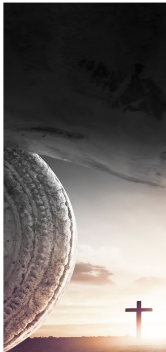
Easter Day March 31 10:45 a.m.