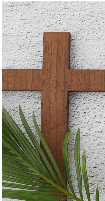
Palm Sunday March 24 10:45 a.m.